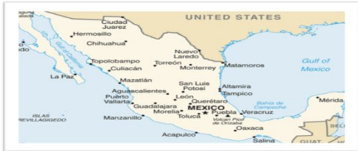
Missionaries since 1977